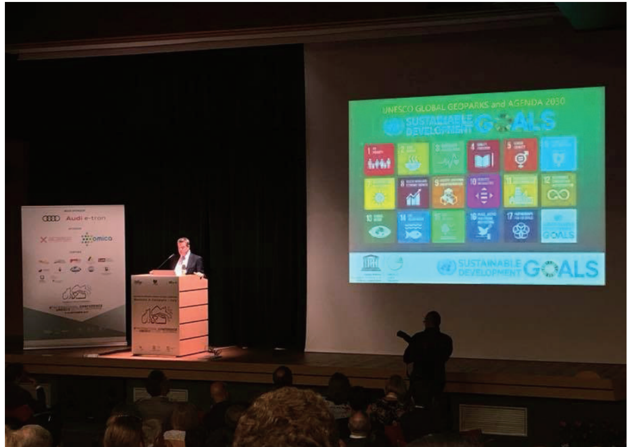
8th International Conference on UNESCO Global Geoparks at the Adamello-Brenta UGGp

(viii) These criteria are verified through checklists for evaluation and revalidation.