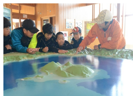
Geotour for children at Takarada Nature House

were added to the Volcano Meisters' list, and 43 Meisters are actively engaging in activities as of February, 2017.