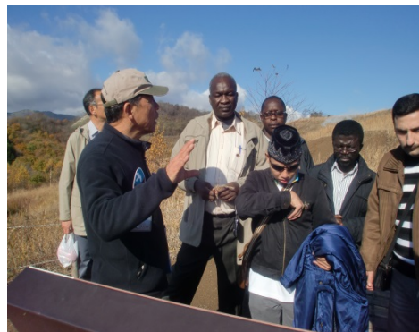
Acceptance of JICA trainees

The visual impact of disaster remains is enormous as a reminder of the effectiveness and importance of conserving some of the damage. To those from developing countries, the Geopark impresses their placement of emphasis on the Volcano Meister system and the knowledge of disaster risk reduction education, because such non-infrastructure measures are more effective in reducing disaster risks than infrastructural development.