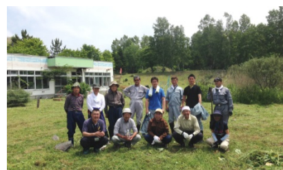
Weeding the grounds of the former Toyako Kindergarten