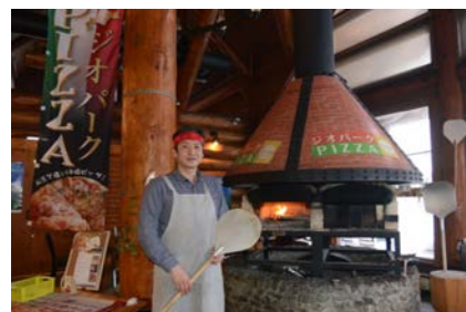
Roadside Station Forest 276 Ohtaki, Date

In a new project, the Council combined the foodstuffs with geo stories, to invent casual and tasty meals: Geopark pizza and Geo hot sandwich. In accordance with the guidelines, four restaurants are certified to serve Geopark pizza: Roadside Station Forest 276 Ohtaki, Date; Namihey Pizza, Toyoura; Restaurant Karzz, Toyako; and Parlor Fukuda, Toyako.