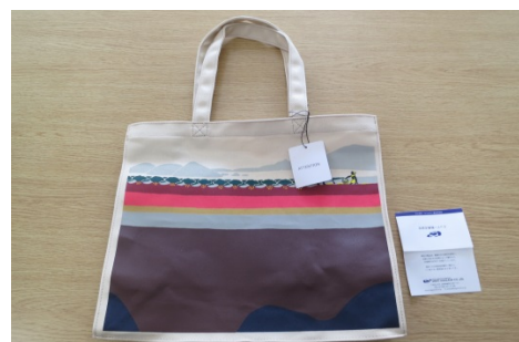
"A pocket of the earth" (2014)

The Toya-Usu Geopark participates in the annual JGN conference, workshops and working group meetings (e.g., evaluation, international commitment, ODA, disaster risk reduction); as well as dispatching Council staff, local nature guides, and Volcano Meisters to other Geoparks as lecturers. The Geopark invited lecturers from Unzen Volcanic Area UGG (Norikazu Ohno in 2016).