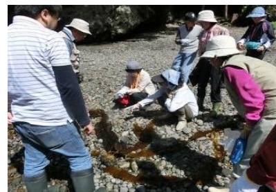
Partnership lecture at Funka Bay coast

Also, interaction projects between guides (seminar, forum, party) motivate the guides to create a new network, which may be difficult for them to do individually during regular activities. This has led to mutual understanding and collaboration among all stakeholders of the Geopark.