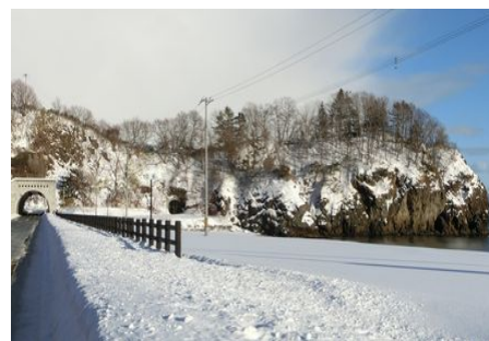
Kamuichashi (God's Fort), a remains from Ainu culture

The close relationship between earth heritage and human habitation is the foundation of today’s community. To focus on this viewpoint, the Toya-Usu Geopark maintains the remains of sites of the Jomon and Ainu periods along the Funka Bay coast as Geopark sites. Archaeological studies have added to knowledge of the lifestyle of the people in those ancient times. To share those new findings with local people, a series of lectures were conducted, such as the Workshop on the Archaeological Site of Kamui-Tapukopu in January 2017.