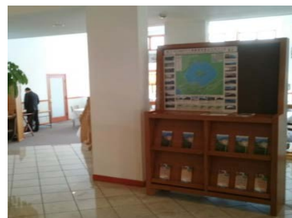
Geopark PR booth in a hotel