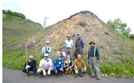
Conserves Mt. Donkoro Observatory Outcrop geosite