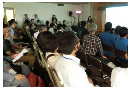
Presentation at APGN 2015

Such experiences have been presented in past GGN meetings (Langkawi, Shimabara, Stonehammer, English Riviera) and APGN meetings (Hanoi, Jeju, San’in). In 2016’s English Riviera conference, the Council managed the workshop for Geoparks and geo-hazards with Shimabara UGG, during which a staff member presented a case study of disaster risk mitigation and Volcano Meister activities.