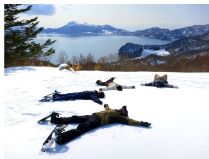
Geo tour in winter: snow-shoe trekking

Geo tours have been increasingly organized in Toyoura and other areas outside Mt. Usu over the past four years. This shows that the geo-tours are not only about the active volcano, but also about ancient submarine volcanic activities, the human-earth link, and many other areas of interest.