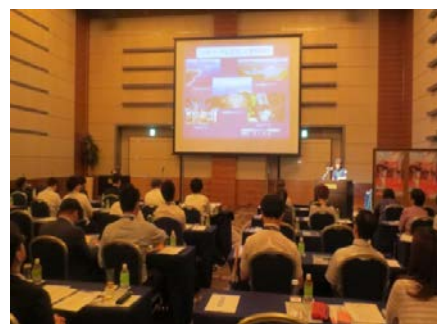
Briefing session for Sendai and Morioka educational trip operators/organizers, August 2016

Since 2013, tourist arrivals to the region have been increasing; exceeding 7.5 million in 2015. With a remarkable increase in Asian tourists, the region has gained a higher popularity outside of Japan.