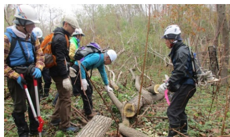
Removal of fallen timber at Mt. Showashinzan trail (2016)