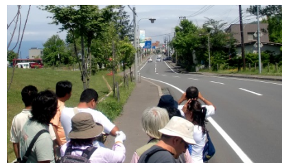
Conserves the fault observation point on Pref. Rd No. 2

(d) Weeded the former National Highway 230 (around the Nishishinzannuma) to allow observation of the 2000 eruption faults (2016).