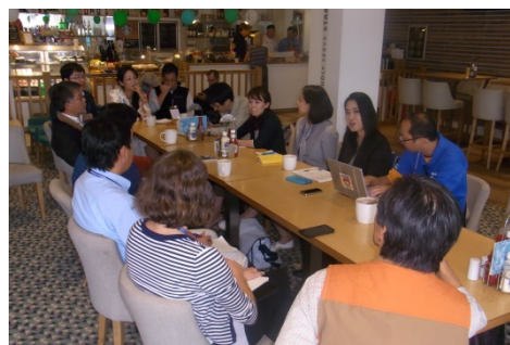
JCaP meeting at English Riviera

The Toya-Utsu Geopark is also a member of JGN's Capacity Development Project (JCaP). This project aims to (1) assist Southeast Asian countries with their launch of Geopark programmes, (2) develop competent Japanese personnel for JGN's international contribution and (3) foster interactions between Japanese Geoparks. In 2016, the working group invited groups representing prospective UGGs in Thailand, Malaysia and the Philippines to several meetings (Niigata