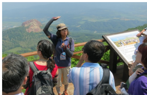
Excursion at the Geopark, AOGS2014

Kumamoto University, Earthquake Research Institute of University of Tokyo, Hokkaido Study Group for Japan Society of Engineering Geology, and Japanese Geotechnical Society. Service for excursions to academic congresses includes Hokkaido Science Teachers Study Group, Asia Oceania Geosciences Society Congress 2014, Japanese Archaeological Association Congress in Date 2014,