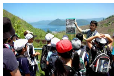
Lesson at Mt. Konpira Footpath