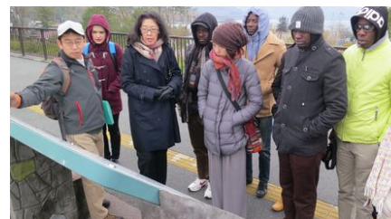
Acceptance of JICA trainees in 2016

The Geopark also accepts JICA trainee groups every year from Southeast Asia, Latin America, Middle East and Eastern Europe, who learn of Geopark activities, disaster risk reduction, environment conservation or tourism promotion. They are shown disaster remains preserved at the foot of the active volcano and utilized as a tourism resource or learning material, and learn the effectiveness of disaster risk reduction efforts. Explanations of Geopark programmes to stimulate developing countries, in which there are few Geoparks, raise their awareness of Geopark initiatives.