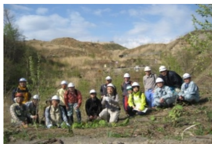
Validation of faults (2014)

Several years after the eruption, the risks of excessive ground temperature or gas burst has become low. Accordingly, an extension of the path closer to the site has been under consideration since 2014.