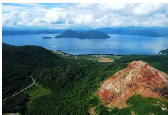
Mt. Showa-Shinzan and Lake Toya

The two greatest strengths of the Toya-Usu Geopark are 'the culture of coexistence of human with volcano and its disasters', and 'the manageability of disaster risks in a tourist destination'. The Geopark will strongly promote these strengths worldwide through the GGN, to create a unique world brand. At the same time, it will accept overseas trainees and observers, as well as offer unique geo-tours by Volcano Masters, to create new interactions in an effort to double or triple the value of the Geopark.