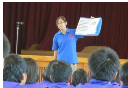
Junior HS students experiencing the shelter life (2016)

The occupations of Volcano Meisters include: tourist association employee, Japanese hotel landlady, school teacher/staff, nature guide, mountain guide instructor, curator, visitor centre employee, ropeway operation company's employee, photographer, town assembly member, local Chamber of Commerce employee, Ministry of the Environment ranger, active ranger, independent business person, homemaker and municipal government employee. They range in age from 20s to 80s. From 2013 to 2016, 20 people