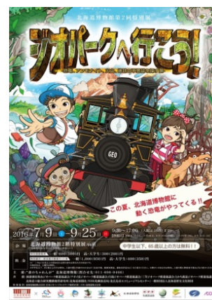
Exhibition "Let's Go To Geopark!" (2016)

The efforts of Toya-Usu Geopark also include the Hokkaido network with two UGGs (Toya-Usu included) and three JGN members. The Hokkaido Museum, the prefecture's largest museum, hosted a special Hokkaido Geopark exhibition in 2016, attracting more than 59,200 visitors. Coupled with the exhibition, Hokkaido-based Geoparks organized events for children/adults, contributed to media feature articles, hosted geo-tours, and provided complimentary goods; all aimed at improving their brand recognition.