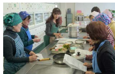
Seminar to learn the relationship between the earth and food